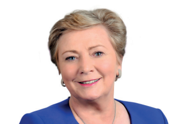
Frances Fitzgerald , Tánaiste and Minister for Employment and Innovation